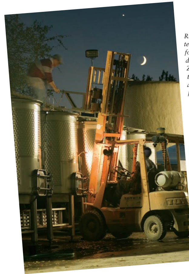
Removing the top from a temperature-controlled fermentor for the first punchdown of the day at 5 AM. All of Navarro's Zinfandel is fermented in these "open-top" tanks with a five-ton capacity. Zinfandel ferments sluggishly and we occasionally have to nudge it along by heating the must, whereas Pinot Noir in these five-ton tanks ferments so quickly that we must restrain the fermentation by turning on the refrigeration.